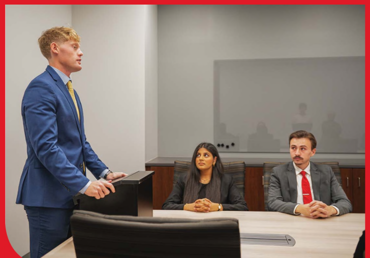
SVSU's moot court team is nationally ranked #4 for undergraduate competition.