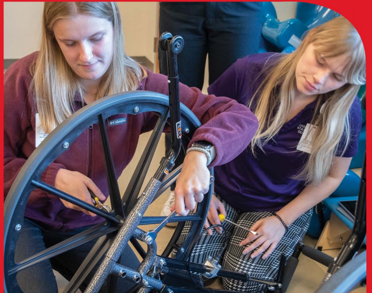
Occupational therapy students performing wheelchair assessments.